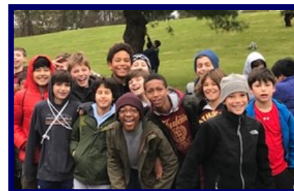
Open-mindedness with Peers