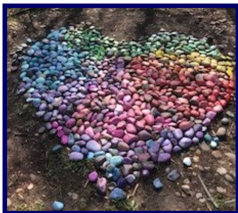
Our Caring Community