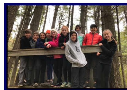
Risk-taking at Outdoor Ed