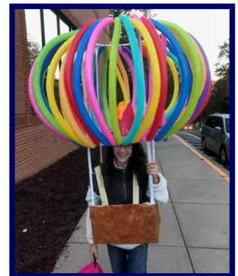
Costume by an Inquirer