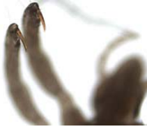
Adult louse claw