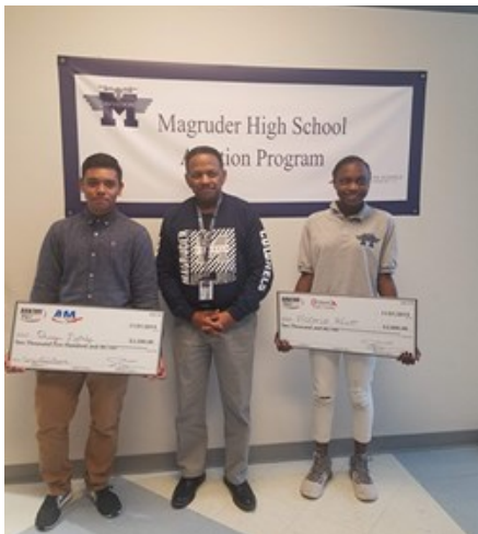
Congrats to our scholarship winners!

On November 1st, 48 sophomores from the Aviation Program attended the Aviation Education and Career Expo at Leesburg Executive Airport in Virginia. The goal of the expo was to expose students to a variety of career and educational opportunities within the field of Aviation. Students listened to exciting guest speakers, as well as visited with college reps, industry leaders and vendors. The day long expo was capped off with two of our students being awarded $4500 in scholarships to help them fund flight school.