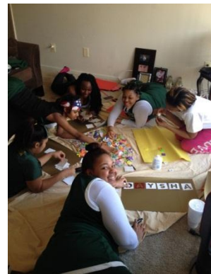
Cheerleaders make posters for the girl's game vs. Magruder