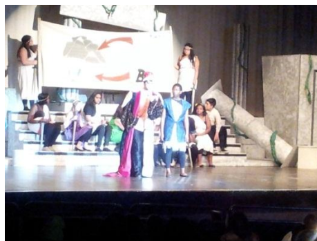
JFK HS - 2014 Winter Musical "Pippin"