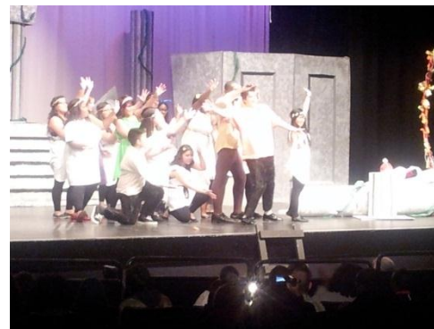
JFK HS - 2014 Winter Musical "Pippin"