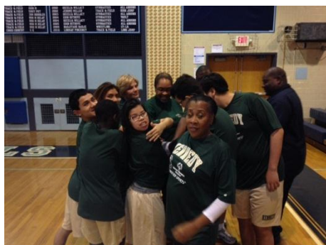
Go Bocce Team!