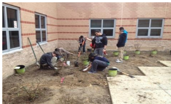
Students working in the courtyard learning for independence