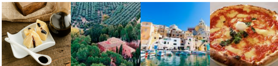
Parmesan and balsamic tasting in Bologna, Olive Groves in Florence, Capri by boat and pizza making in Rome.

It seems that there isn't momentum around a Spring Break 2025 trip to Peru OR Southeast Asia so we are switching gears and looking at a trip called "A Taste of Italy." This trip will see historic and cultural highlights of Italy but will also include experiences in the culinary arts. There will be an interest meeting via zoom at 7pm on Wednesday November 7th. More info will be sent out via Canvas.