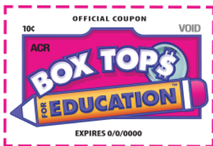
Old Clip-able Logo

Box Tops for Education is making its way into the 20 th Century! Download the Box Tops app and scan your receipt after purchasing any items with the new Box Tops Logo. The school will automatically receive 10¢ for each Box Tops item. During the transition, you may still see some of the old logos. They can be clipped and sent in to the school. Visit boxtops4education.com for more info.