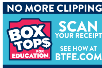
New Scan-able Logo