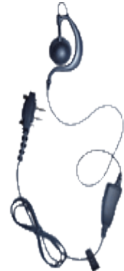
Agent Single Wire Agent C-Hook