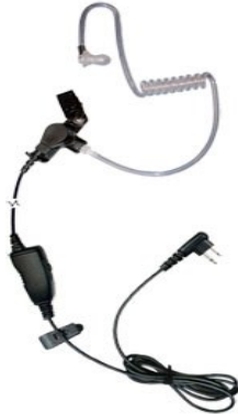
Star Single Wire Ear Bud Coil Tube