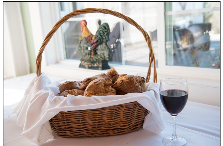
Normandie Farm Restaurant has More than Popovers

Business meeting/luncheons are held four times a year at the delightful Normandie Farm Restaurant, 10710 Falls Road, Potomac, MD 20854.