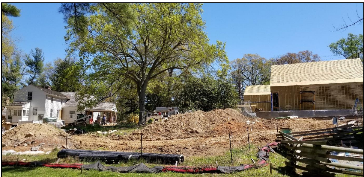
Josiah Henson Visitor Center and Museum under construction next to the Riley Plantation house.

While the MCPSRA Board did not have the opportunity to discuss and/or recommend either question C or D, it is clear that BOTH CANNOT PASS as they are mutually contradictory. You are therefore encouraged to consider this issue and either vote for C or D but NOT both. Alternatively, should you elect to vote “no” to both, or not vote for either choice, the council will remain as it is today. The choice is yours.