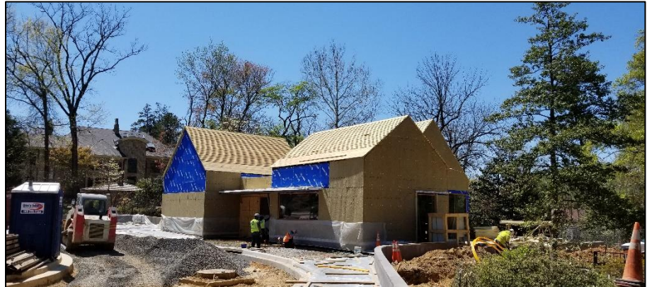
The Josiah Henson Park Visitor Center/Museum is under construction.

Montgomery Parks Foundation reports that construction of the Museum building and rehabilitation of the plantation owner's house is proceeding and on time. Thank you for your financial support. Your contributions to the Henson Project are matched by MCPSRA. There is another photograph of the property on page 11.