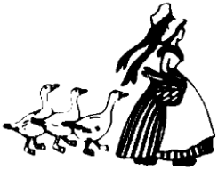
Normandie Farm Restaurant

Unfortunately, the October 15 MCPSRA luncheon has been canceled due to COVID 19. Meanwhile, here is some interesting information regarding Normandie Farm.