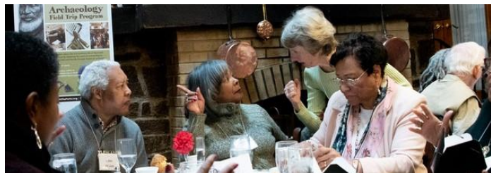
Members enjoying themselves at our February luncheon.

Business meeting/luncheons are held four times a year at the delightful Normandie Farm Restaurant, 10710 Falls Road, Potomac, MD 20854.