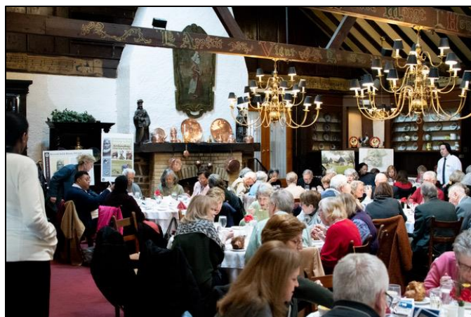
Normandie Farm... more than popovers