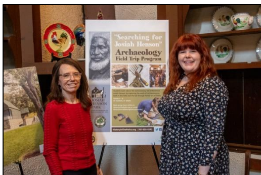
Josiah Henson Project Update