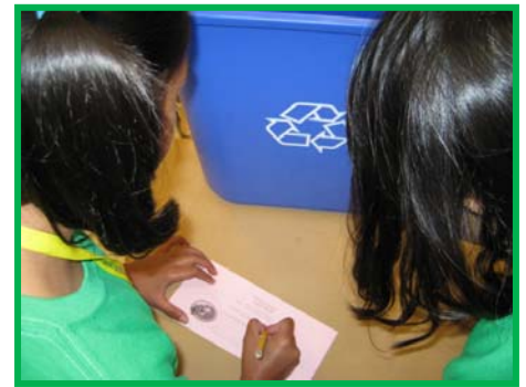
The Recycling Rangers from Olney Elementary School

How does Olney Elementary School (ES) integrate recycling into their day?