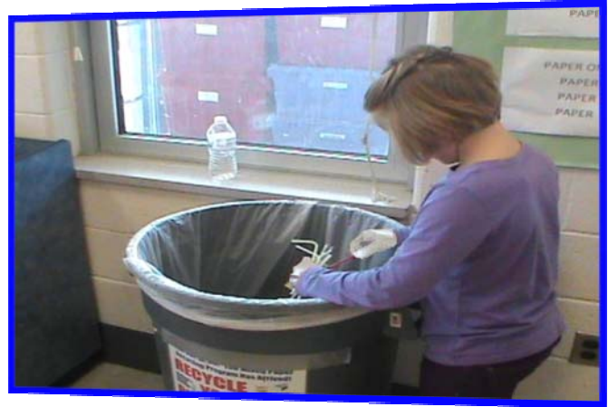
Recycling monitors at Bethesda Elementary School remind and assist.

Do the recycling bins in your cafeteria get contaminated with straws, spoons, and other non-recyclables at lunchtime? The staff and students at Bethesda Elementary School are trying to prevent contamination in their recycling bins by assigning “recycling monitors” at each bin. Monitors are trained on what can and cannot be placed in their bin and to act accordingly.