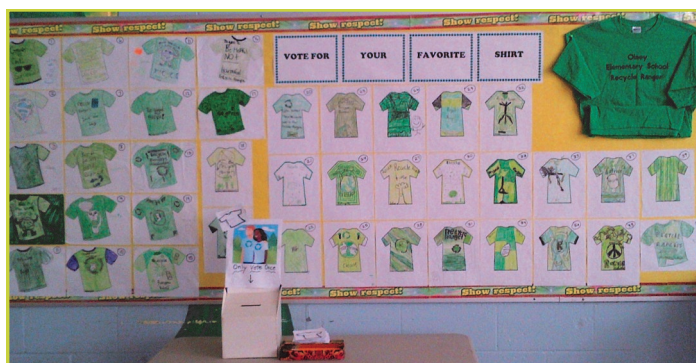
Entry Bulletin Board