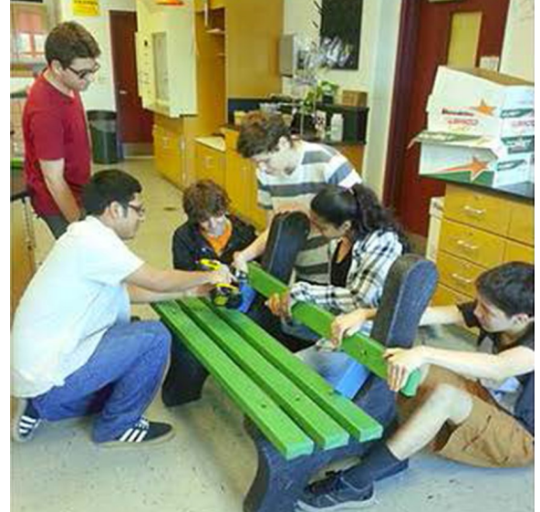
More than 200 pounds of plastic bottle caps were upcycled into a bench that the students and staff of Northwest High School will enjoy for years to come.