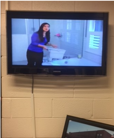
Richard Montgomery High School’s team takes advantage of the morning announcement videos to promote water conservation habits.