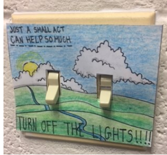
The SERT Club at RMHS created light switch covers with beautiful eco-friendly designs that draw attention to the light switches and remind students and staff to turn off the overhead lights whenever they’re not needed.