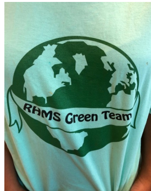
Rocky Hill Middle School’s Green Team designed their own T-shirts this year. The students have become walking billboards, promote conservation, recycling, and being “green.”