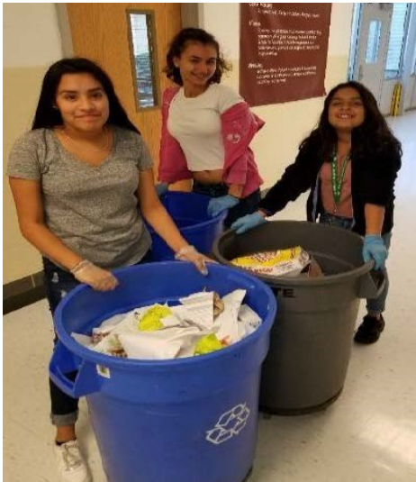
With an average monthly recycling rate of 7.27 pounds per person (PPP), Redland Middle School is recycling well above the average middle school rate of 4.12 PPP. We’re sure that has something to do with their awesome school-based SERT team!