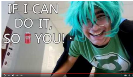
The Green Team at Northwest High School uses videos and humor to help spread the importance of recycling and saving energy. They’ve also created a comprehensive website as part of their Green School application that described their activities, projects, meetings, data, objectives and more.