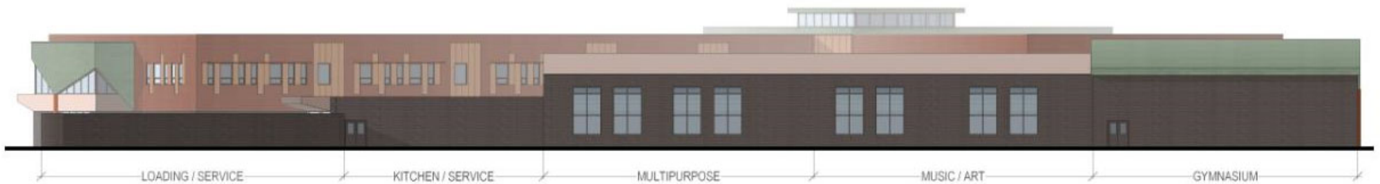
South Building Elevation