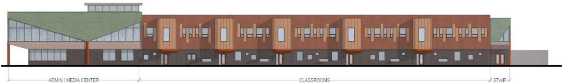
North Building Elevation (Childs Street Elevation)