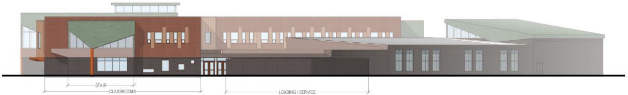
West Building Elevation